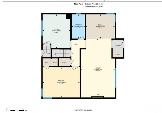
11611 111 Ave NW, Edmonton, AB