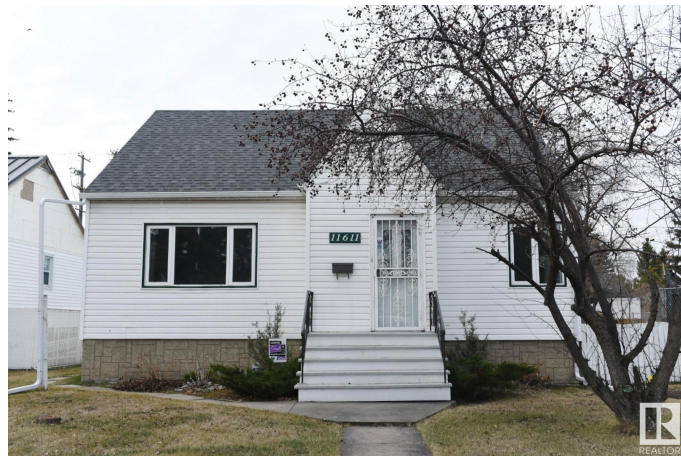
11611 111 Ave NW, Edmonton, AB